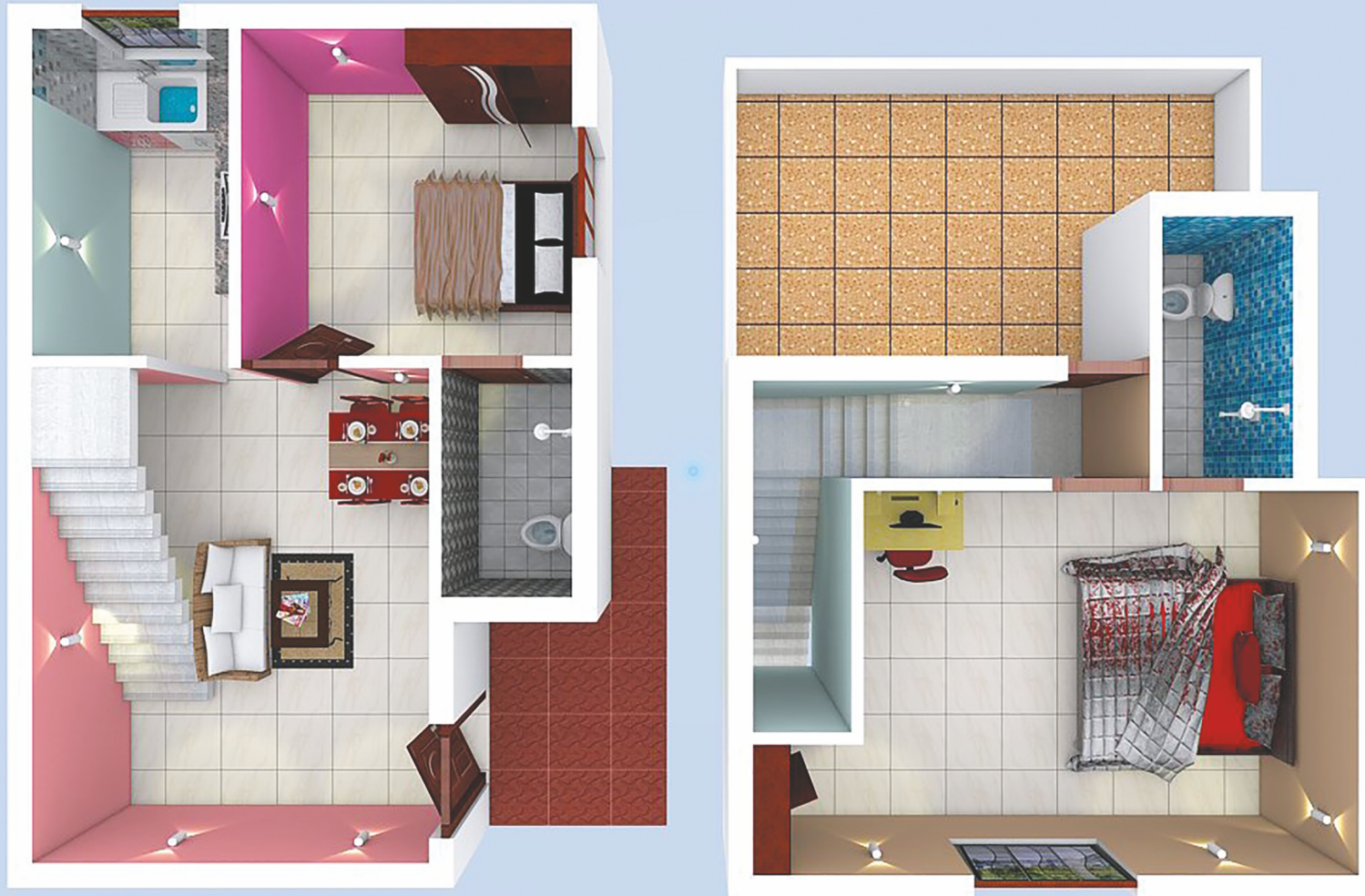
20'X30' _3D TOP VIEW SOUTH FACING

Near by Schools, Colleges, Hospitals, Shops, Restuarants , SIPCOTS